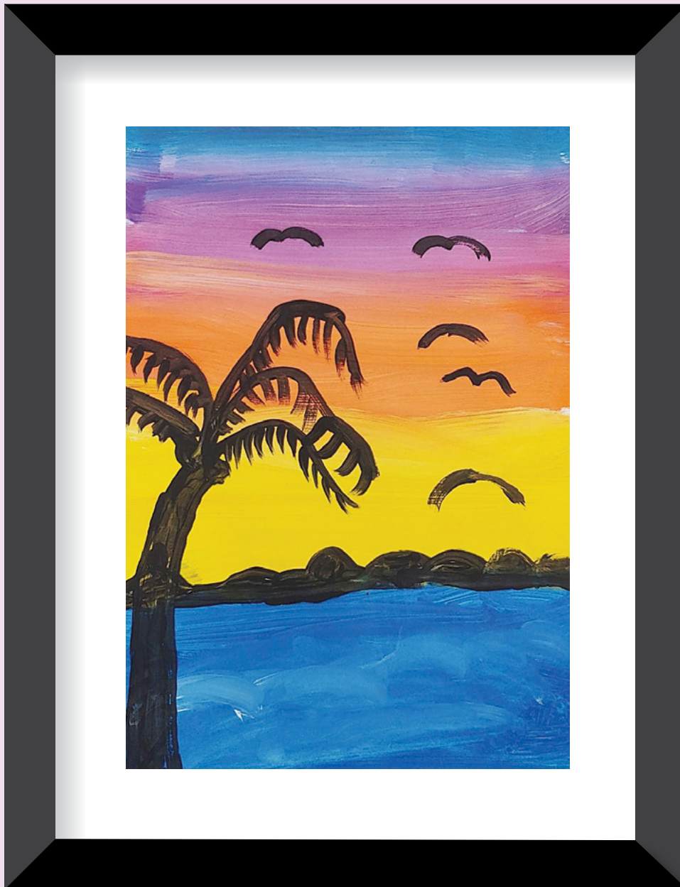
Kyngston Campbell , Lakeshore Elementary School