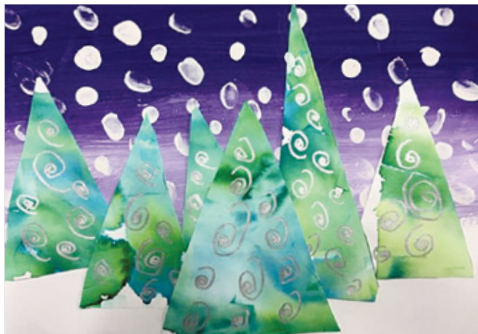
Norah Eccleston , Autumn Lane Elementary