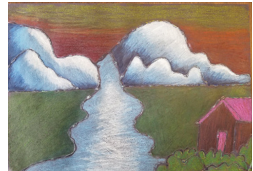
Destiny Barstow , Phoenix Academy