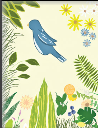
Abigail Fay , Arcadia High