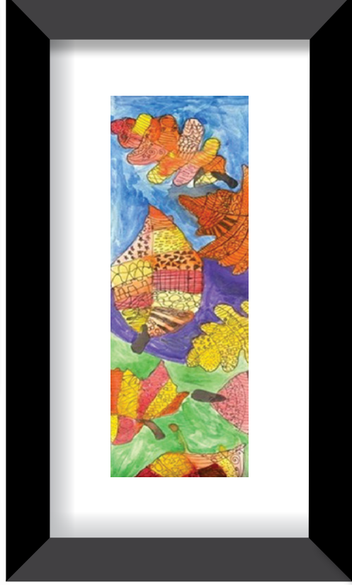
Artists: Aaliyah King , West Ridge Elementary (Spider); Sophia Riley , Holmes Road Elementary (top); Dim Nuam , English Village Elementary (bottom)